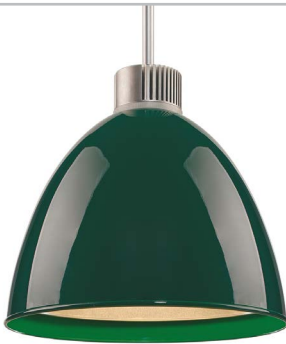
904 british racing green