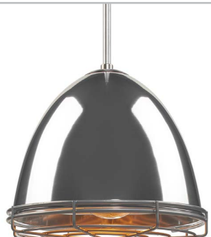
shown with Wire Guard Accessory