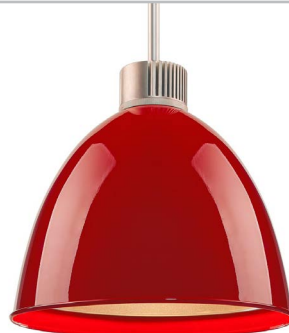
902 gypsy red