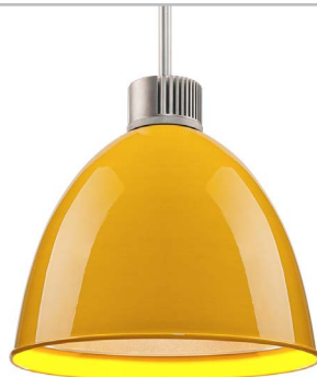
906 canary yellow