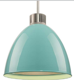
903 larkspur blue